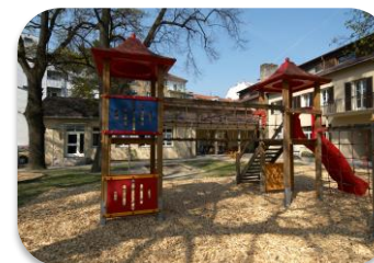
2 children's centres & 6 youth centres