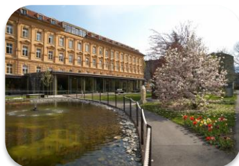
8 residential and nursing homes