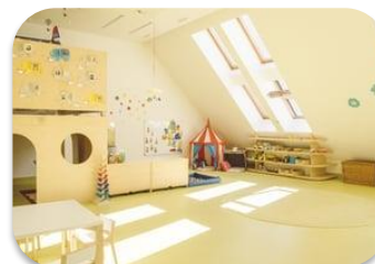
1 kindergarten & 11 crèches