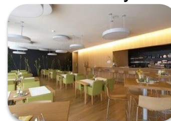
2 restaurants & 5 coffee houses