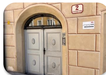
outpatient addiction prevention centre