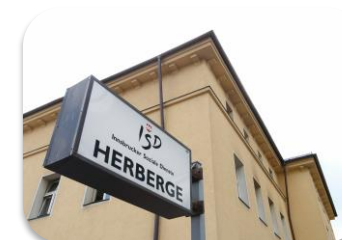
4 facilities for the homeless