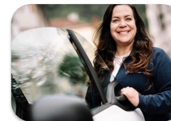
home nursing service & community nursing