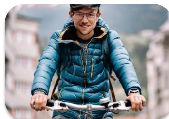
mobile social work