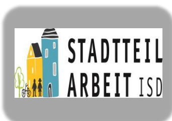
8 neighbourhood centres