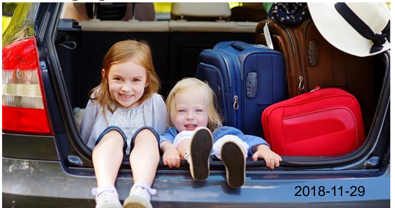
Kronoberg – Swedish pathfinders!