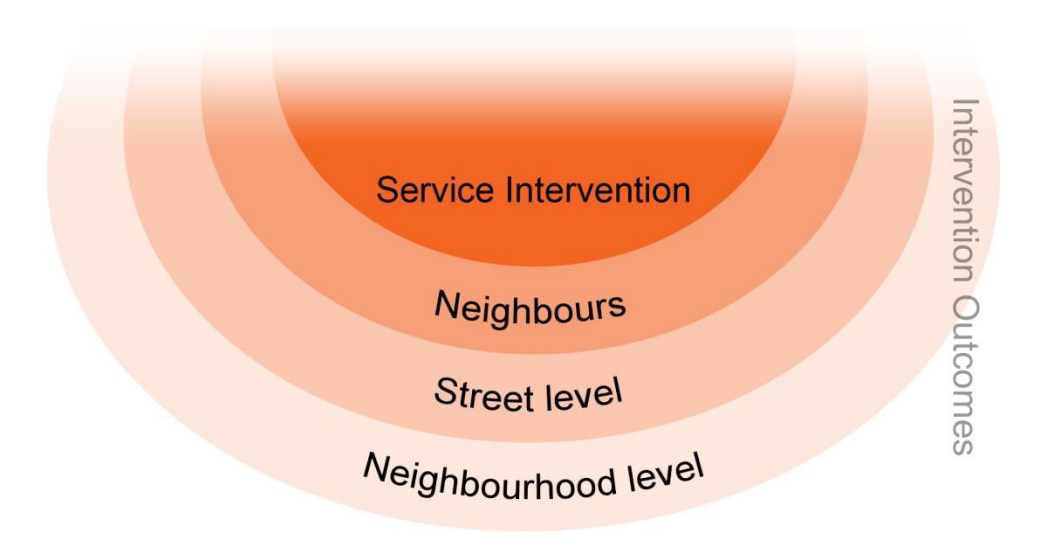
Figure 3: Service intervention – levels of effect<sup>23</sup>

Conclusion: They conclude that the area-based interventions addressed the neighbourhood environment to such an extent that future health impacts of the Dutch District Approach may be expected. The health effects in the long term might be more substantial when area-based interventions were devoted more to the improvement of the socioeconomic circumstances of residents.