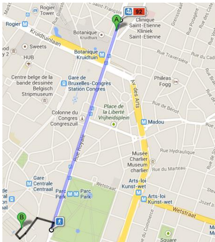
B. Kwint Restaurant